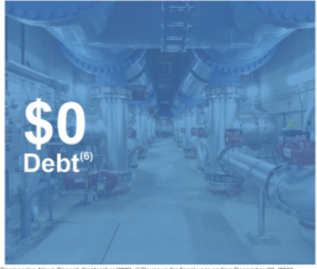
"Rankings for 'Dems and Reservoirs," "Water Supply," and "Nater Treatment and Desaination Plants" published in Engineering Nevo Record, September 2022. "Revenue for fiscal year ending December 30, 2022 "Revenue for fiscal year ending December 30, 2022 generated from public entity contracts.